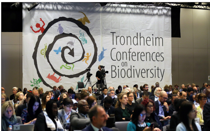
Participants during the Conference

Verona Collantes-Lebale, UN-Women, presented on gender elements in the post-2020 framework. She pointed to calls for clearly linking the post-2020 framework to the SDGs, highlighting equal rights to resources, including land-related rights. She noted that, despite progress on gender equality, there is a "backlash" and uneven power relations, with implications on rights and control of resources. She also drew attention to expert